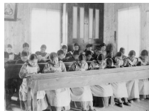
“Indian boarding school” - cultural genocide

In the residential schools many eye witnesses have recently come forward to describe the atrocities. They called these places “death camps” where, according to government records, nearly half of all these innocent Indigenous children died or disappeared as if they never existed. In the 1920’s when Dr. Bryce was alarmed by the high death rate of children in residential schools, his report was suppressed.