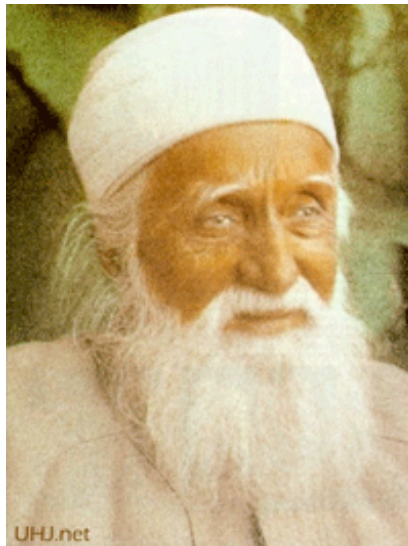
'Abdu'l-Baha, Davidic King

“Until the heavenly civilization is founded, no result will be forthcoming from material civilization, even as you observe. See what catastrophes overwhelm mankind. Consider the wars which disturb the world. Consider the enmity and hatred. The existence of these wars and conditions indicates and proves that the heavenly civilization has not yet been established. If the civilization of the Kingdom be spread to all the nations, this dust of disagreement will be dispelled, these clouds will pass away, and the Sun of Reality in its greatest effulgence and glory will shine upon mankind.” –Abdu'l-Baha, Chicago, May 5 th , 1912